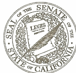
STATE SENATOR, 29 TH DISTRICT

With my sincere appreciation and best wishes!